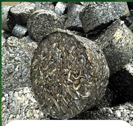
Briquetted Metals 压块金属